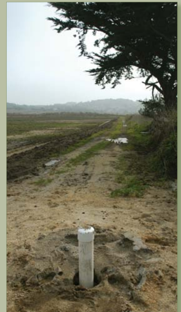
Completed monitoring well

The MWSD installed and tested five wells in areas that were previously unexplored for groundwater production. One high-yield well location was identified. A successful five-day pumping test was conducted that yielded high quality groundwater. Mea-