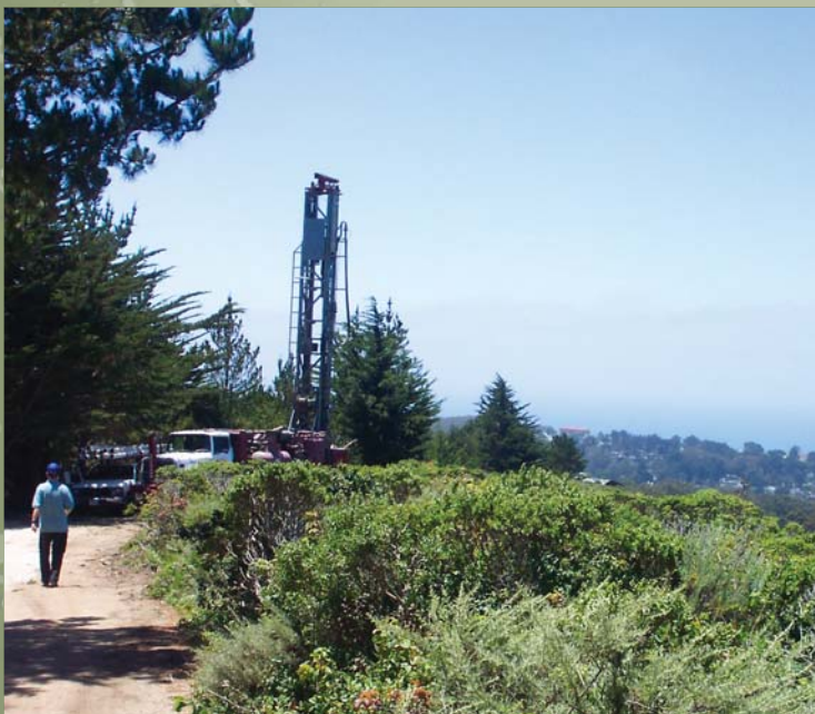
Monitoring well drilling in Coastal Range

surements of yield, drawdown, water quality, and temperature indicate that this well draws upon a large volume of fracture rock within Montara Mountain. The well tests showed no evidence of hydrogeologic barriers or boundaries that might restrict the volume of yield from the well, and no potential to induce seawater intrusion. The reliability of this well will be established through its use over time. ☞