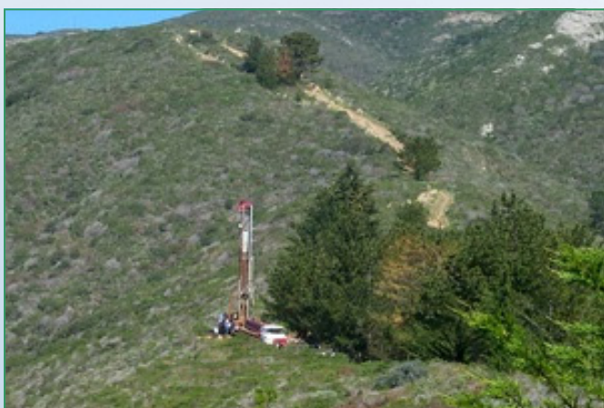
Water well drilling in fractured granitic bedrock