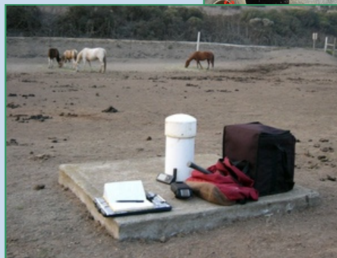
Groundwater quality monitoring of coastal alluvial aquifers