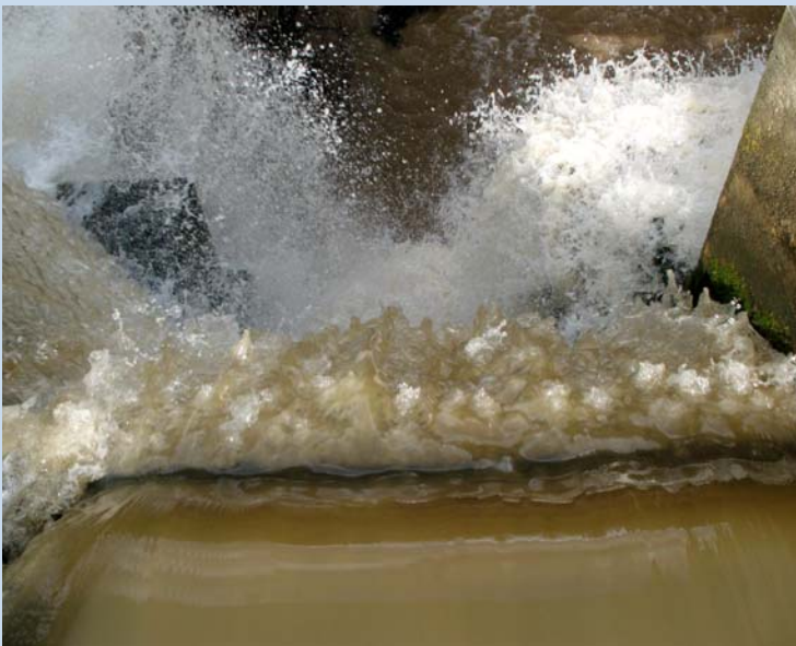
Sediment-laden water flows over spillway of Searsville Dam